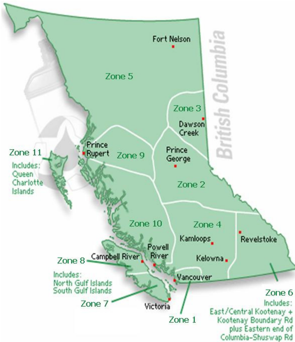
Zone Chart Return Incentive (RI) Program